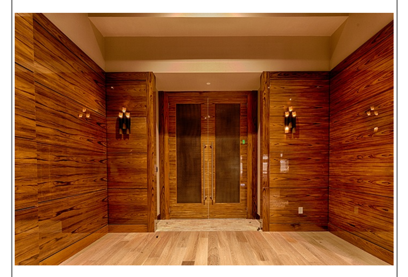
Veneer Visions is a quarterly newsletter by Interwood Forest Products. Interwood was established in 1987 as the US division of Fritz Kohl Veneer Mill in Karlstadt Germany.

While the One-directional cathedrals is most desired there are spectacular projects which utilize all parts of the cathedral coming from one log. Below is a project by Indiana Architectural Plywood in which an entire Teak log was used in a duehouse corridor, creating visual interest with its variety as well as driving the visitor forward with the horizontal application.