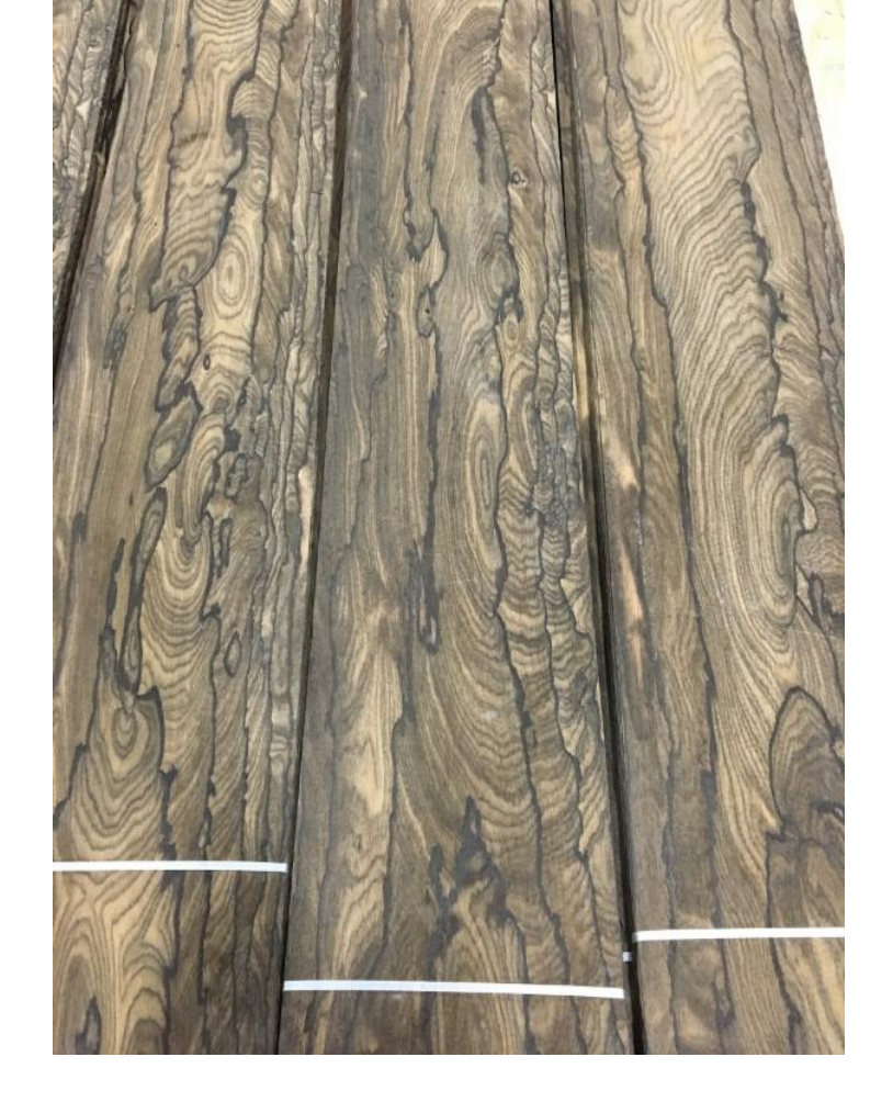
Book-matching the sapwood creates intense character