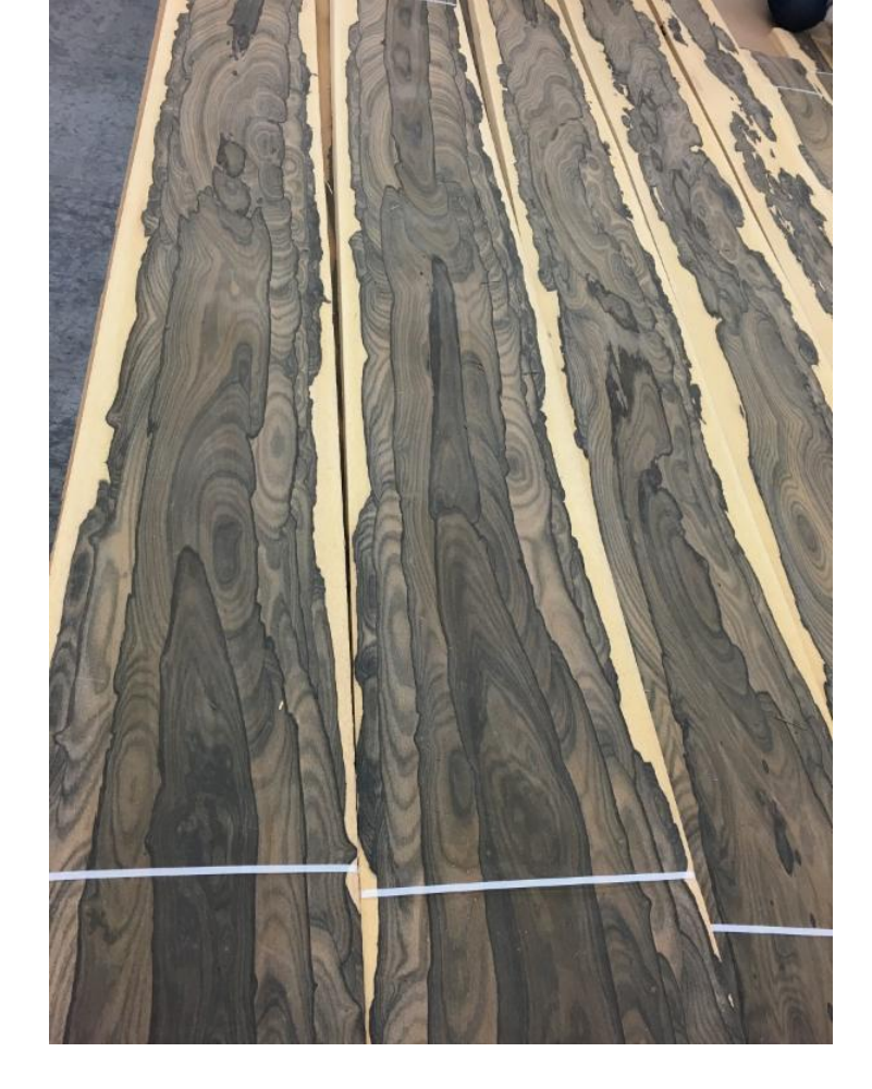
The smaller diameter of the tree means a faster growing sequence

Its grain is visually striking with a white-yellow sapwood and heartwood dark brown with irregular deep black zones. Very decorative when matched to accentuate the sapwood, its intense character makes it preferable for special carvings and high end architectural woodwork.